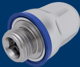
3028 | Straight screw-in connector in hygienic design